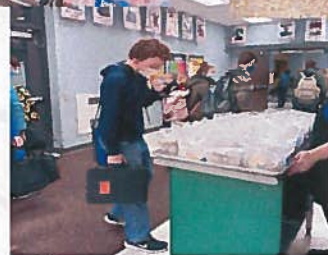
Salad Thursday has become a staff favorite